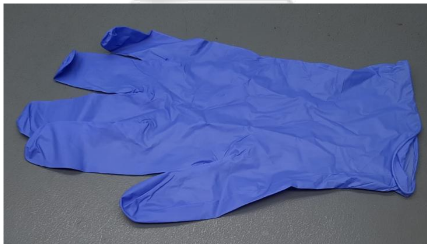
Photo 1: Powder Free Nitrile Examination Gloves, CleanGuard, Size M