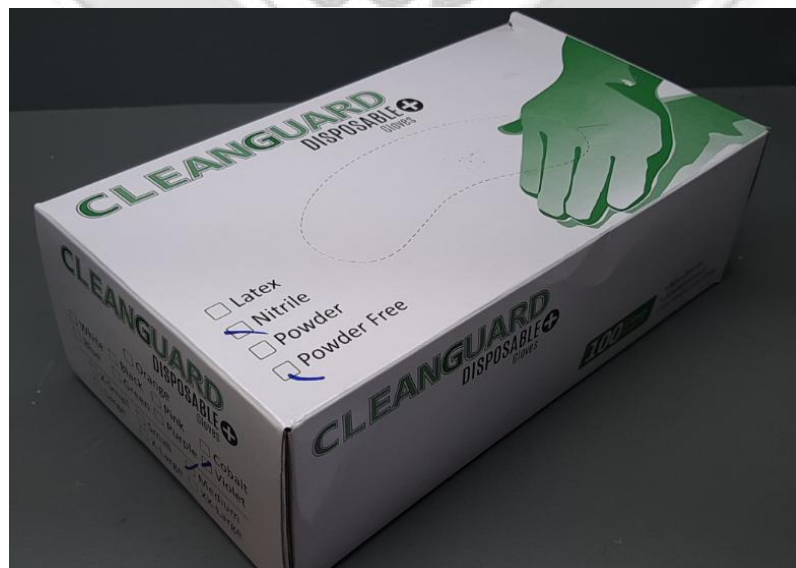
Photo 2: Packaging for Powder Free Nitrile Examination Gloves, CleanGuard, Size M