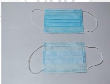
Photo of Samples

Note: Pass = Meet customer requirements; Fail = Fail customer requirements; # = No comment; N.D. = Not detected.